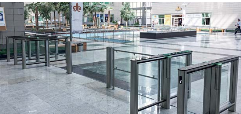
Speed gates ST-01, Nazarbayev University, Republic of Kazakhstan