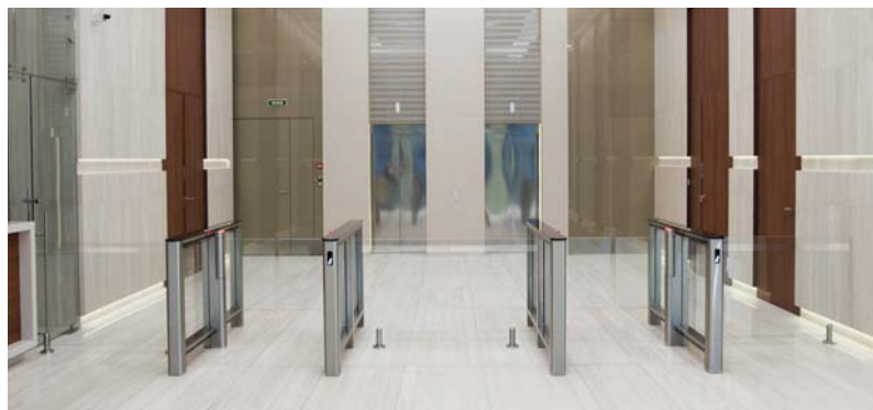
Speed gates ST-01, PERCo headquarters, Russia