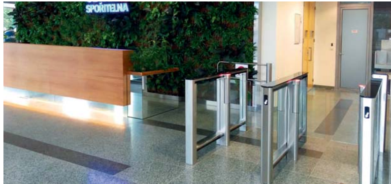
Speed gates ST-01, Bank Ceska sporitelna, Czech Republic